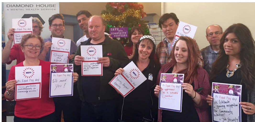
South Australian ASU members at mental health service Diamond House celebrating Equal Pay Day on 1 December 2015.