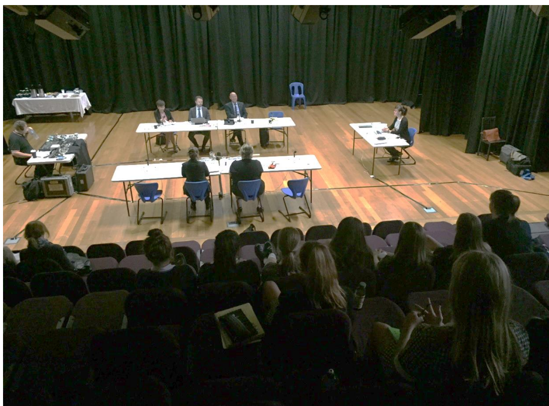
Students from Melbourne Girls' College observing the public hearing held at their school on 18 February 2016.