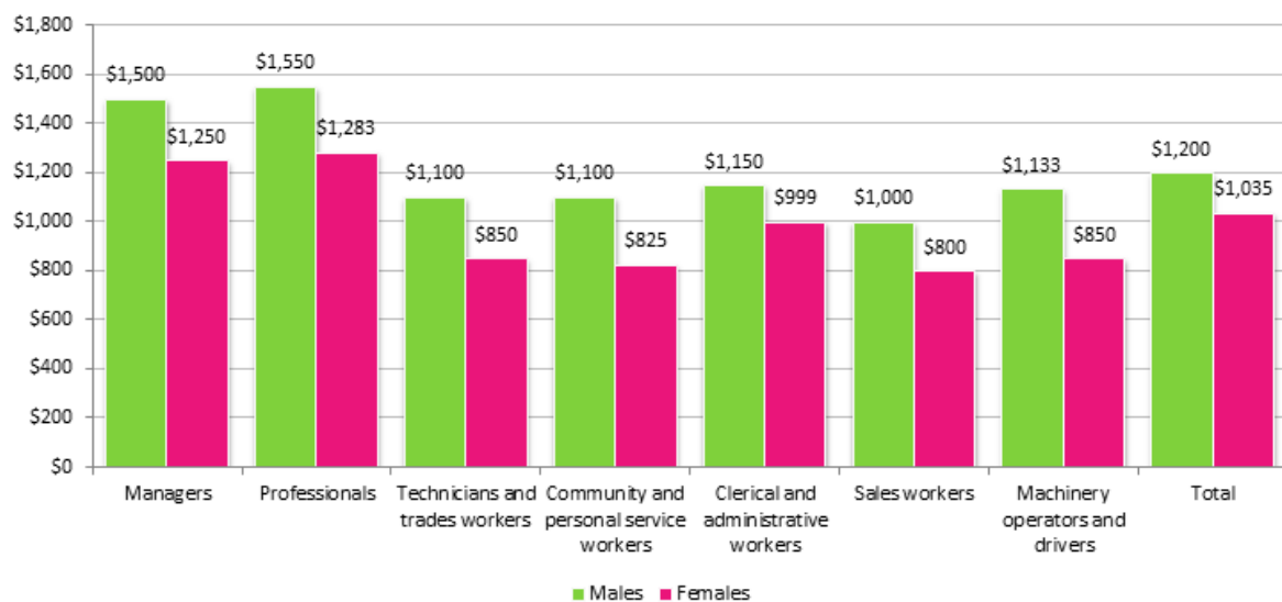
Median Weekly Income (Full-time employees) by Gender and Occupation: