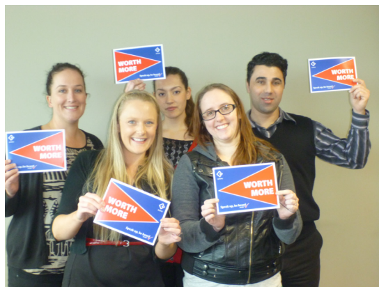
Your ASU JTG NNT members.

Don't forget to send us your photos too.